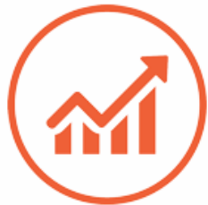
Enterprise Performance Manager