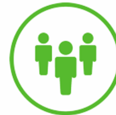
Watson Engagement Manager