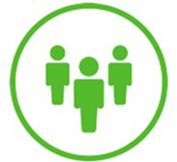
Watson Engagement Manager