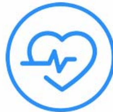
Watson Care Manager